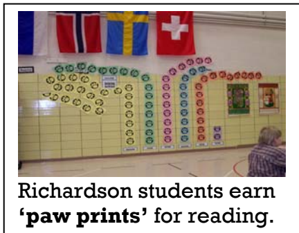
Richardson students earn ‘paw prints’ for reading.